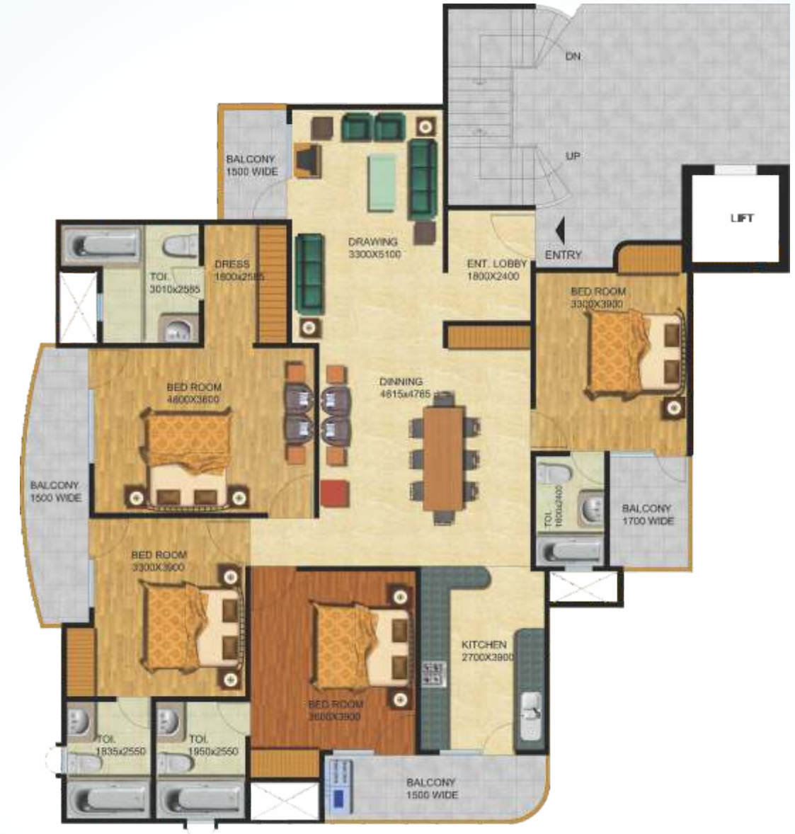
TYPICAL FLOOR PLAN 2535 Sq Ft