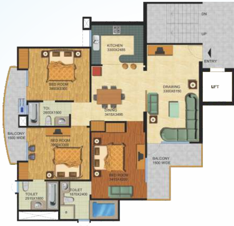
TYPICAL FLOOR PLAN 1750 sq. ft.